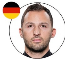
Domenico Tedesco Ex-coach of the FC Spartak Moscow